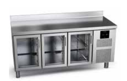
EMFP-180-GN CR PC

VISIBILITY: Double pane door and anodised aluminium frame with double vacuum chamber.