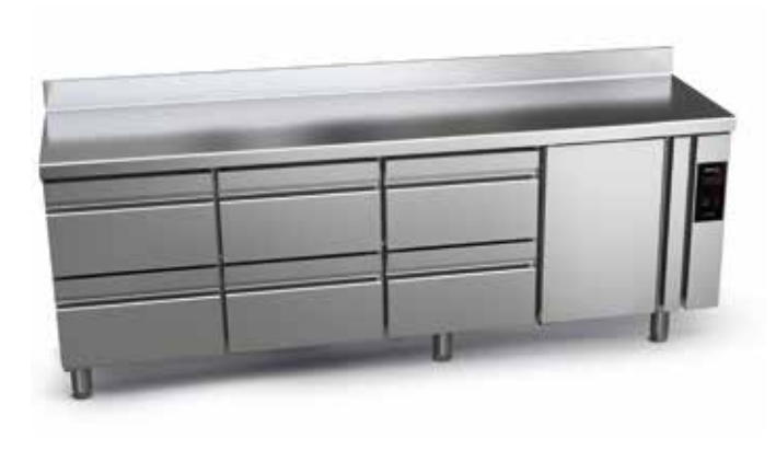
ADAPTABILITY: Units ready for the connection of a remote cooling unit. The cooling unit is not included.