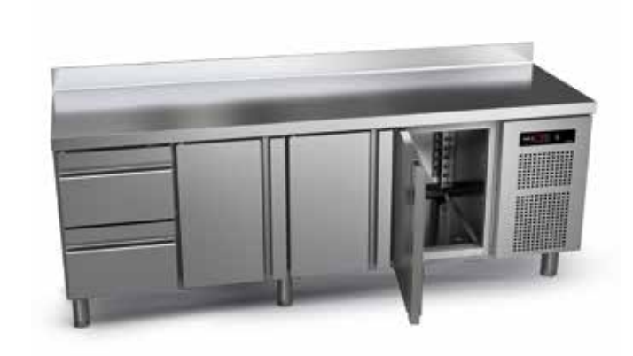
ROBUSTNESS: Our perforated stainless steel drawers can stand loads up to 40 kg.

We have different versions of drawer kits and doors available Set 2 drawers ( \rm H ) Doors ( \rm D)