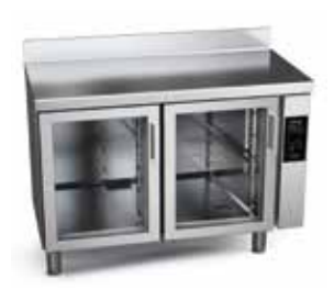
EMFP-102-GN-R CR PC

ADAPTABILITY: Units ready for the connection of a remote cooling unit. The cooling unit is not included.