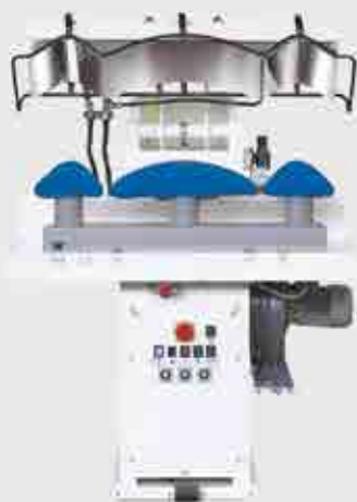
Universal press for shaped formal garments and diverse types