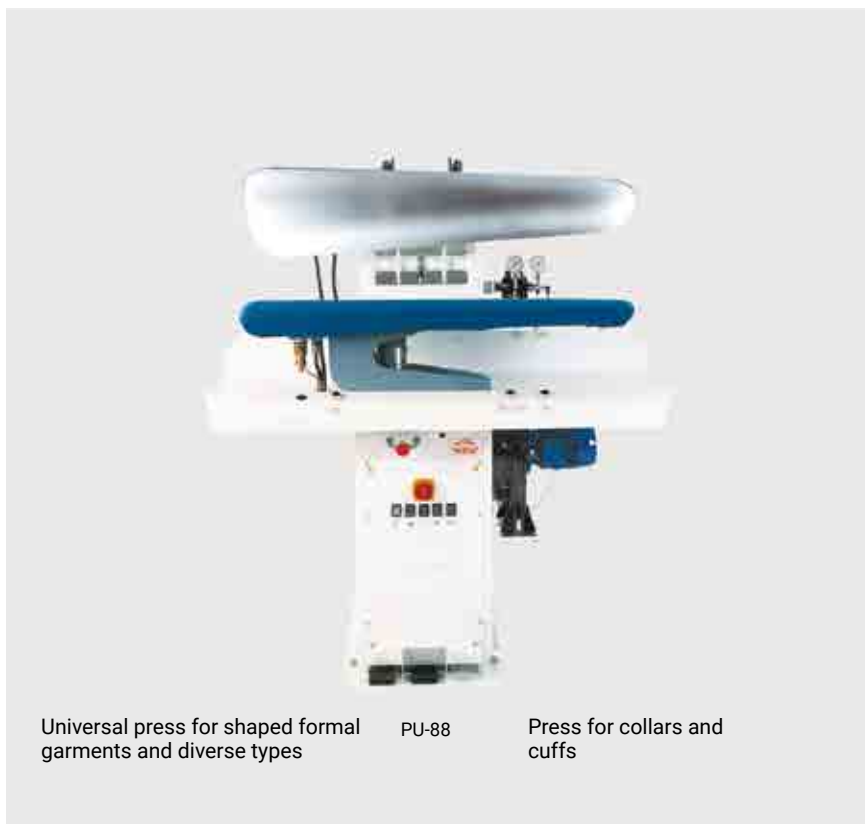
Universal press for shaped formal garments and diverse types